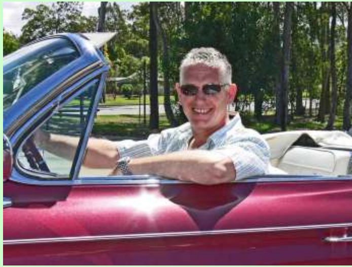
Clives beautiful 61 Cady